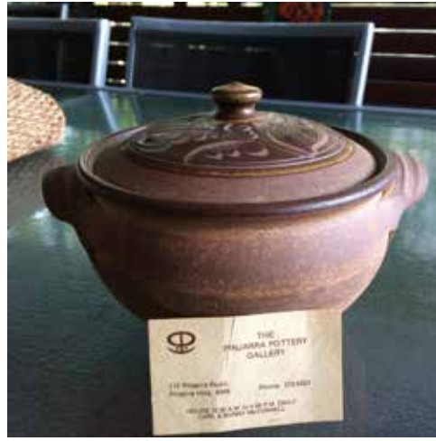
Carl McConnell casserole found in a Lifeline shop