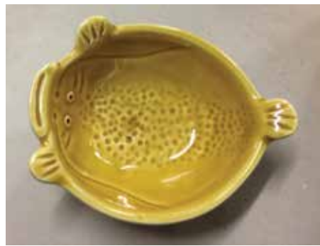
Anthony's small Japanese fish bowl