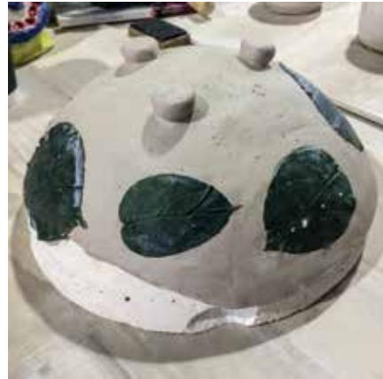
Bowl with leaves