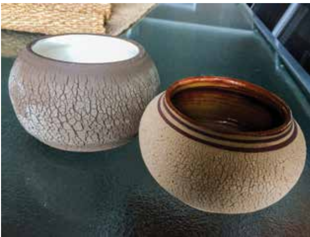
David's test pots with sodium silicate. The rougher the clay the more pronounced the texture