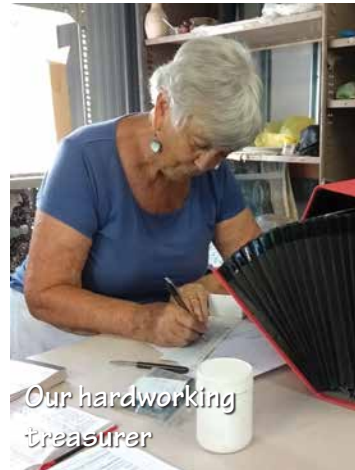
Our hardworking treasurer