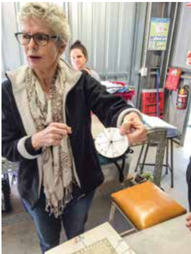
Gai and protractors. The protractors in their various sizes are used to mark the position on pots for feet, handles, lugs etc. Can be made from pieces of board even old CDs.