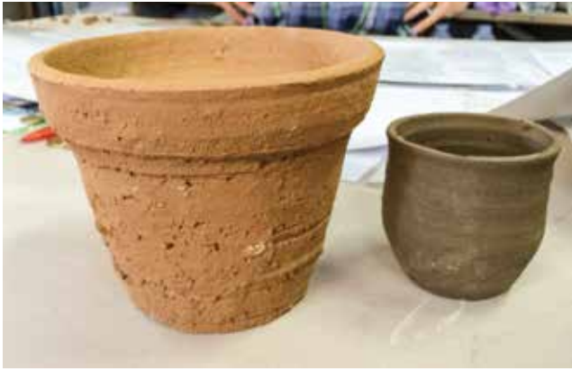
Anthony's Mt Nebo clay samples from his brother's property. The pot on the left uses clay brought in as fill - the right sample is native and will probably lose its colour when fired - will be interesting to see the results.