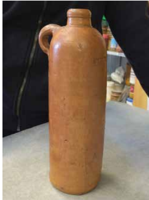
Susan's Dutch ceramic bottle for spirits - could be quite old but they were produced in great numbers.