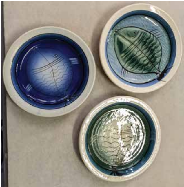
David's finished plates from the decorating workshop.