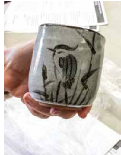
Judy's mug bought in Japan with beautiful brushwork only to discover the exact same image in Pottery Supplies on Japanese papers!