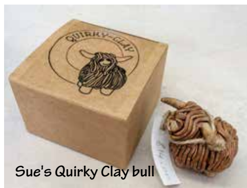
Sue's Quirky Clay bull