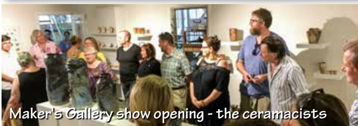
Maker's Gallery show opening - the ceramacists