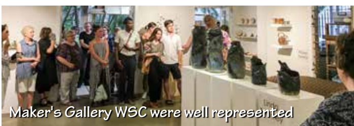
Maker's Gallery WSC were well represented