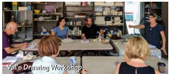
Yal's Drawing Workshop