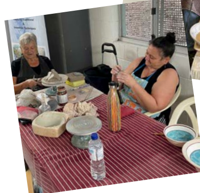
WSC set up at BVAC