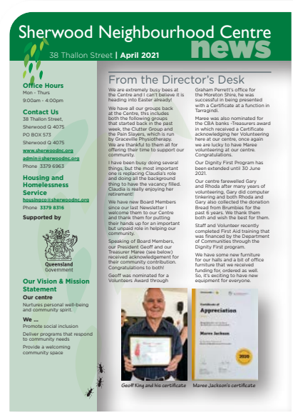
The Sherwood Neighbourhood Centre (SNC) news for April 2021. WSC gets a mention for our clean-up. We are members of SNC. Click here to view a copy