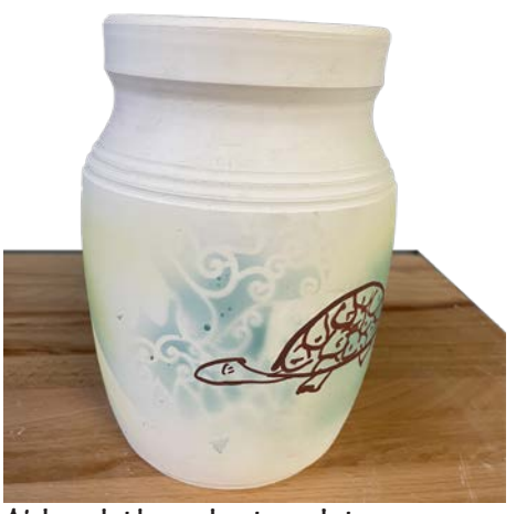
Airbrush through a template