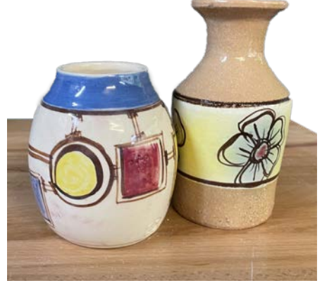
Body Stains - airbrushed and brushed Tape to mask and colours overlaid