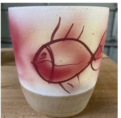
Airbrush over line drawing