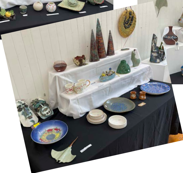
Some of our work on display at our 2026 exhibition - Visions in Clay