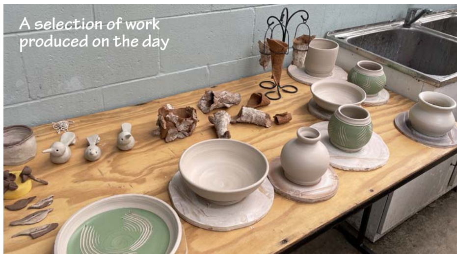
A selection of work produced on the day