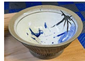
Some of their winning work