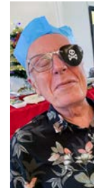
There's one in every crowd!