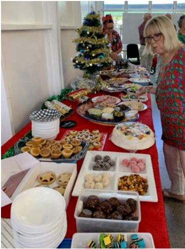
Our feast for lunch!