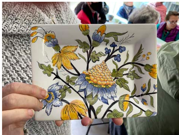
Diane brought along a colourful Faïence plate.

Sometimes known as Majolica - Italian. A white tin based glaze is applied to bisque ware and decorated with coloured glazes or stains/enamels and fired to temperature.