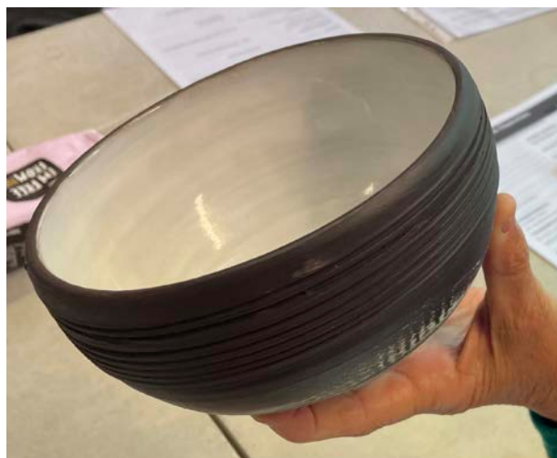
Stacey presented 2 bowls in black clay with different glazes fired to around cones 6/7. The white glaze on the inside is zinc free.