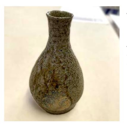
At left is a wood-fired bud vase from Derek.