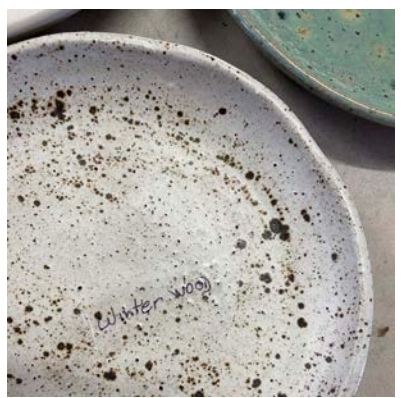
Sample of Mayco midfire glazes by Gai. Aurora Green, Sea Salt (actually Alabaster with 2 coats and top coat of Sea Salt with speckles) and Winter Wood