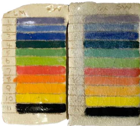
Samples of underglaze fired high and low to demonstrate the degradation of colours at stoneware (right) compared to low fire (left).