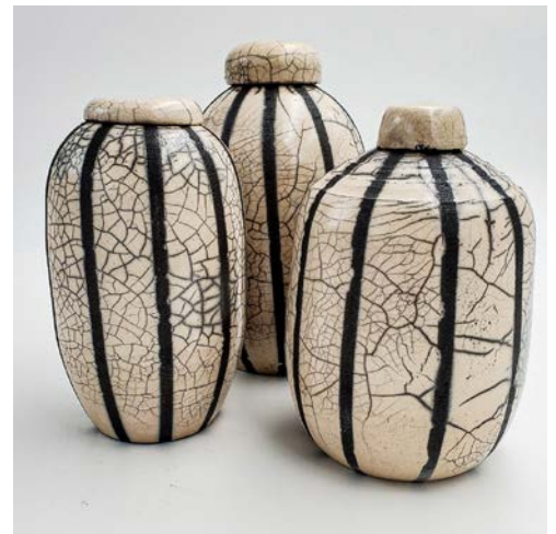
Wax resist used on Raku ware - the black of the reduced body shows through where the wax has resisted the glaze and burned off