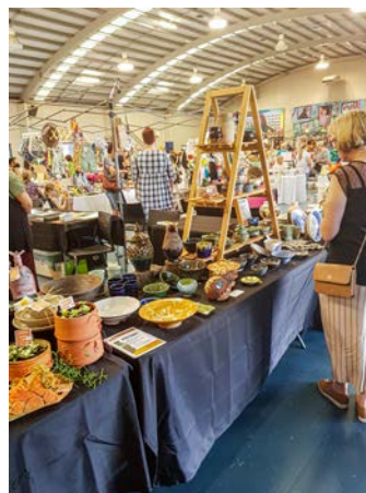
Our Mother's Day market stall at Moggill