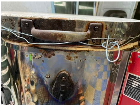
A very Australian kiln repair!!

The best potter's sponge - Turtle Back found in the tile section of Bunnings.