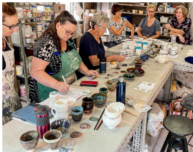
The group taking notes. Samples of glaze mixes and pots of glaze ready to use.

Ally has had a lot of experience mixing and overlaying with Mayco glazes (see photos below).