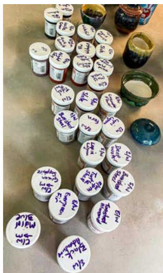
A selection of earthenware and midfire glazes to sample