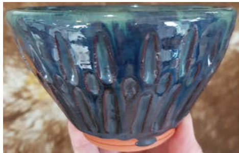
Low fire bowl: Black Adventurine x 2 under Lavender Flower x 2 on rim Pure Black Adventurine on base.