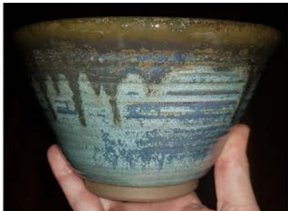
Midfire bowl: 2 coats of Cesco Brick Red under 2 coats Mayco Speckled Toad with Root Beer on rim and a trim of Black Walnut.