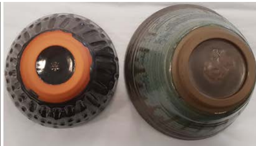
Pure Black Walnut on base of each - low fire left and high-fire on the right..