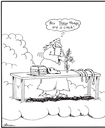
God makes the snake.