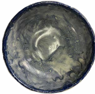
Diane's small bowl with lustre was a problem. Where the lustre is too thin it appears purple. It was agreed the best way to apply it is on a wheel with a steady hand as it revolves to give an even line.

The blue bowl was a bit rough around the edge and called for a reglaze!