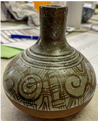
David presented a small Djinn bottle with brush decoration under a glaze and mid-fired.

The blue bowl was a bit rough around the edge and called for a reglaze!