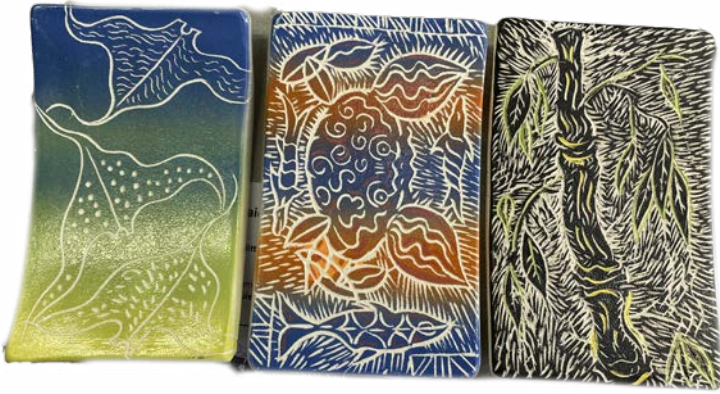
Derek's 3 Sushi Plates.

A follow-on from his sgraffito workshop Derek added 4 little feet and slightly bent them so the sushi stays in place.