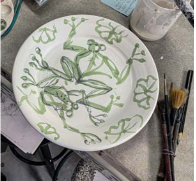
Lyn and samples of our work from just done to glazed and fired.