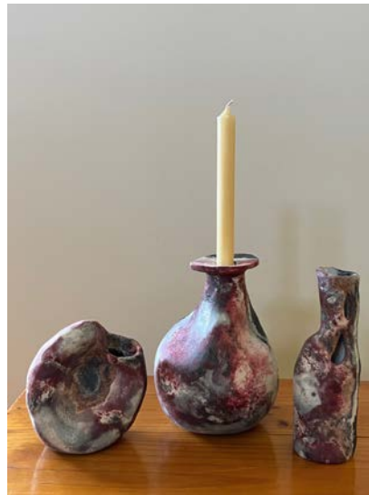
Building up twigs and firewood The teepee takes shape Teepee covered in paper and slip (?) Ready to fire The results Pots cleaned up