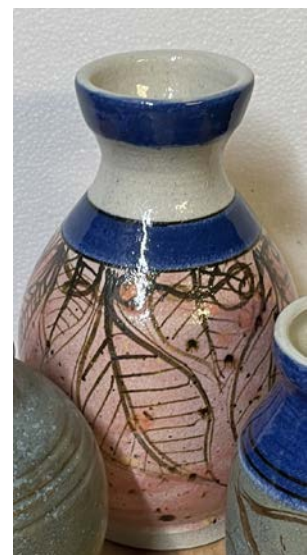
David's Rotten Pumpkin glaze