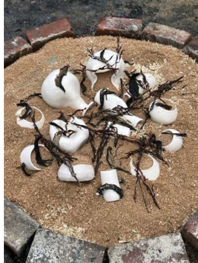
Setting the base Pots and Combustibles in place