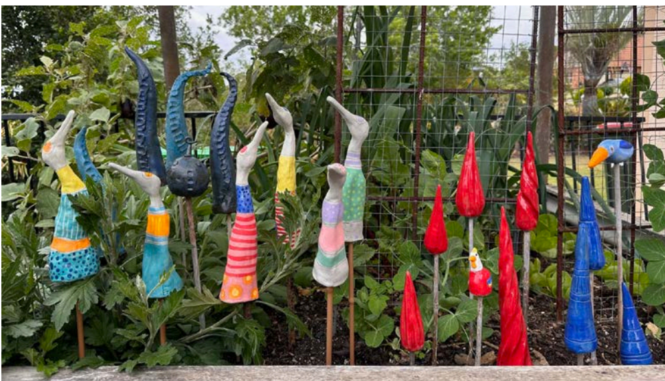
Linda's Ducks and spikes in the garden!