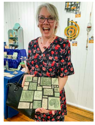
A happy raffle winner