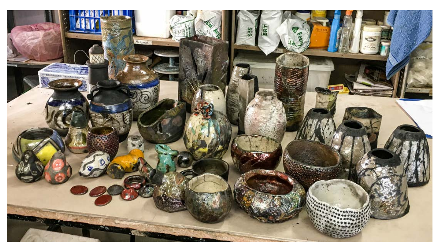
The results of the Raku workshop from 4 October

If you are not sure, fire low - earthenware.