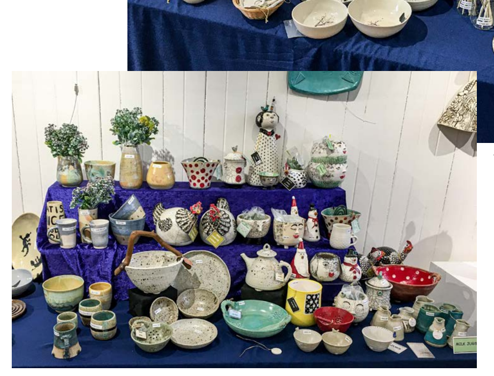
The blue cloths gave a consistent professional look to all our pieces