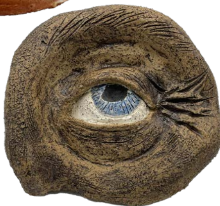
The eye is decorated with slip, stains and rubbed back glaze. The mouth is glazed with Electric Shino.