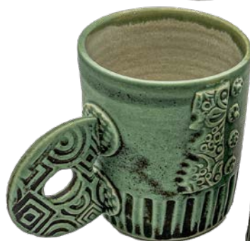
Gai brought these along to demonstrate some of Nicci's work in preparation for our upcoming workshop - more info soon!