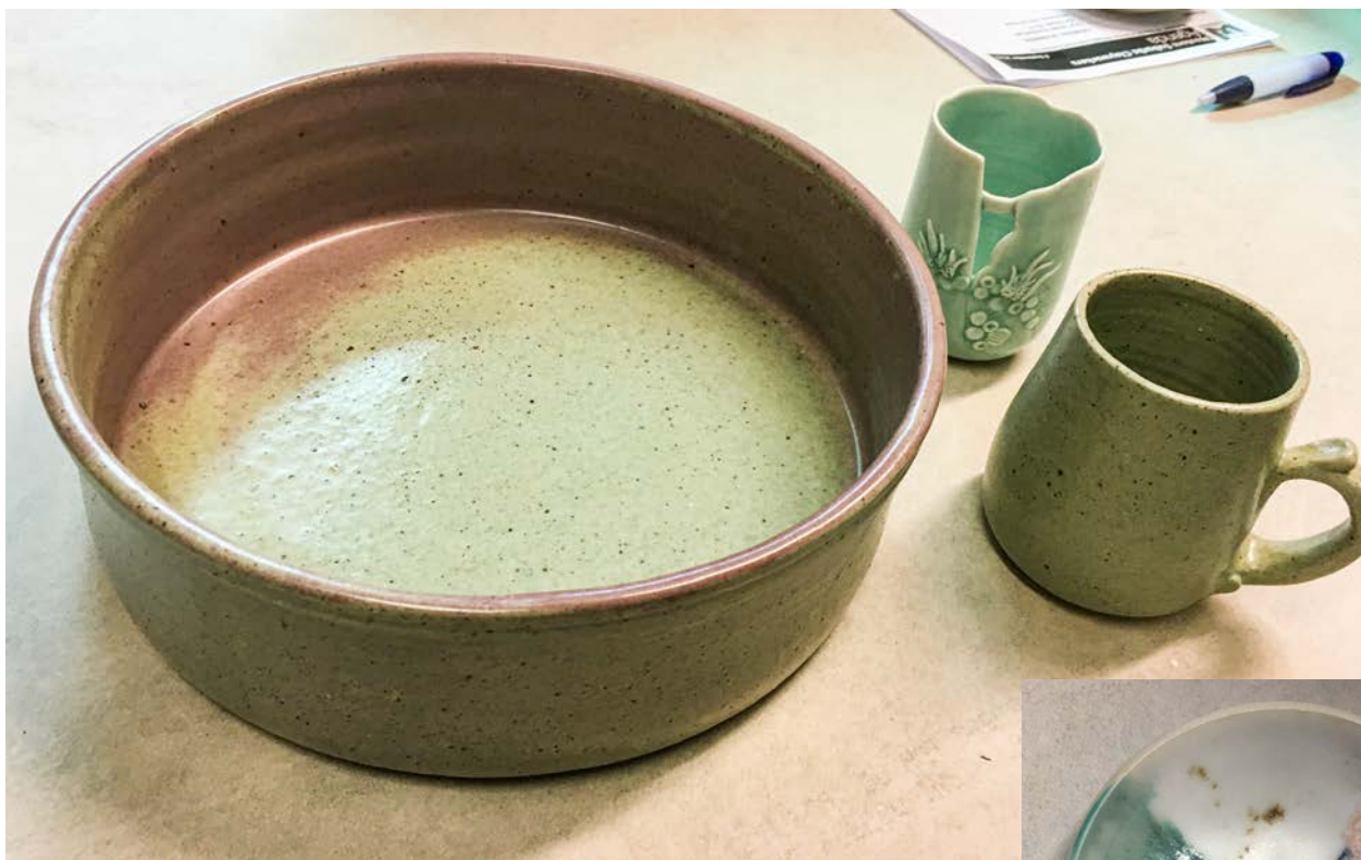
Sample of white slip with Mako crystal samples

A homemade celadon glaze, fired to cone 6 in a gas kiln, was used on all three items. Two different clays were used. The large bowl (Derek labelled it a dog bowl) and the mug were made from a blend of Walkers 10 and Feeney's BRT. The blueish reef pot was a porcelain clay. The purple on the large bowl is the effect from unwanted reduction in the gas kiln. Gai and Cam