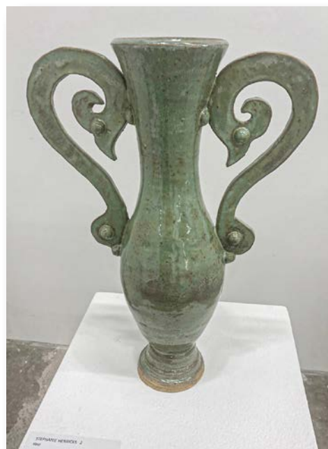
Stephanie's spectacular vase!