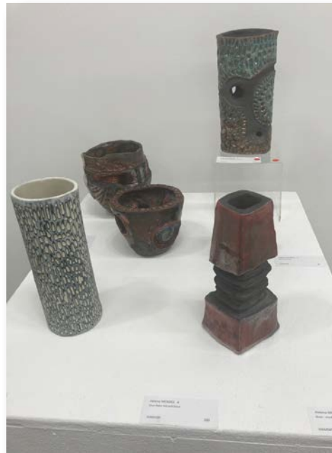
Helena's work Congratulations - one sold!