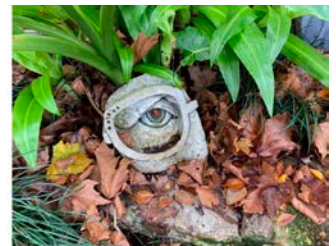
Some of Kate's work